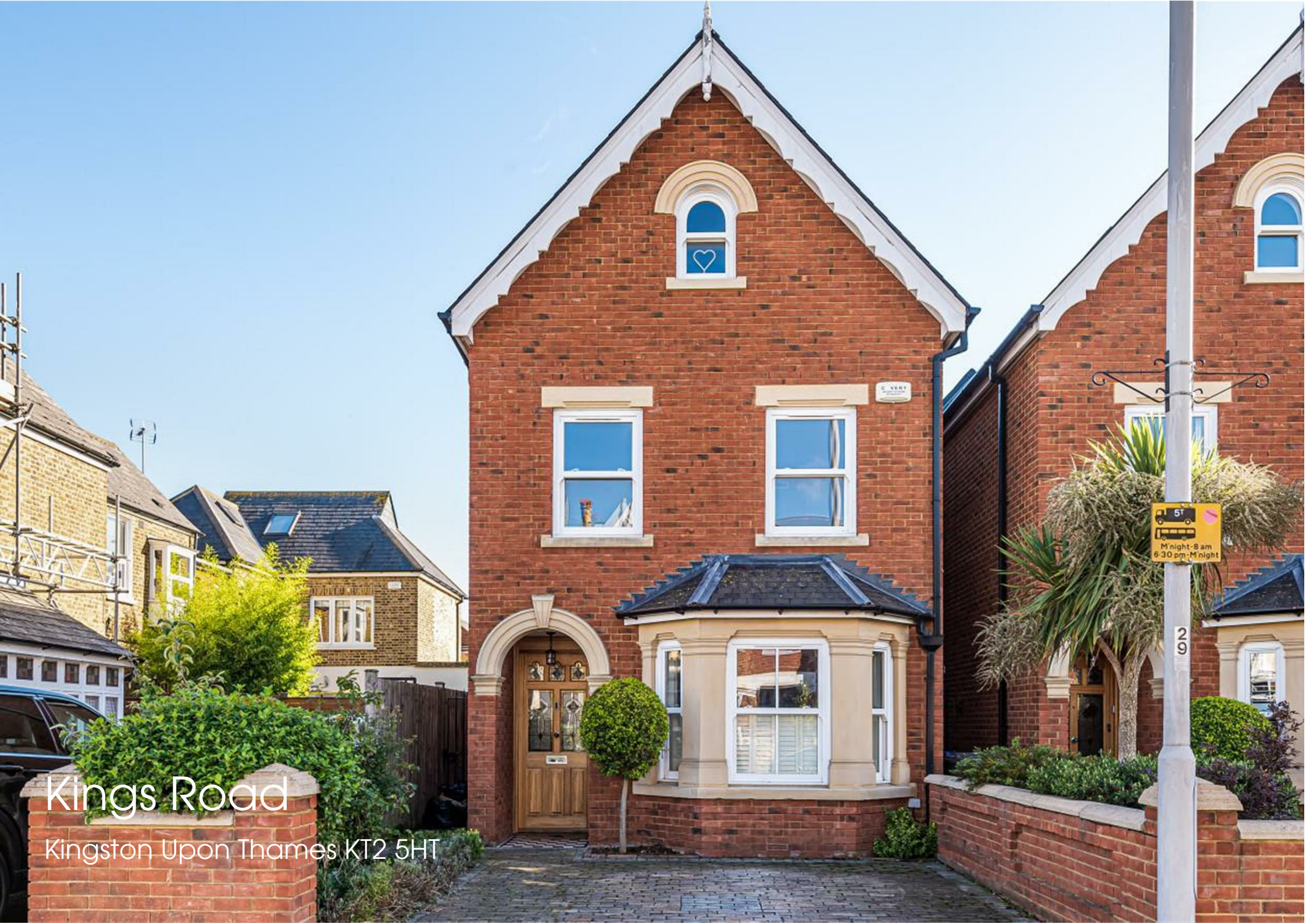
Kings Road Kingston Upon Thames KT2 5HT